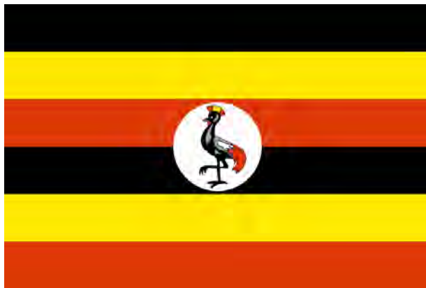
Flag of Uganda