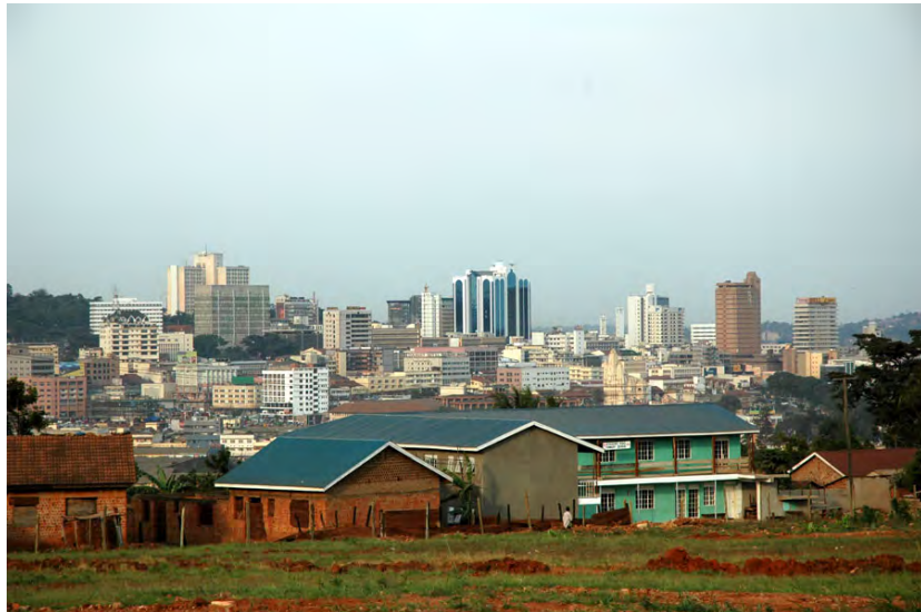
Kampala, capitol of Uganda

First Presbyterian Church, Columbia SC, and Covenant Presbyterian Church, Issaquah, WA; June 30–July 13